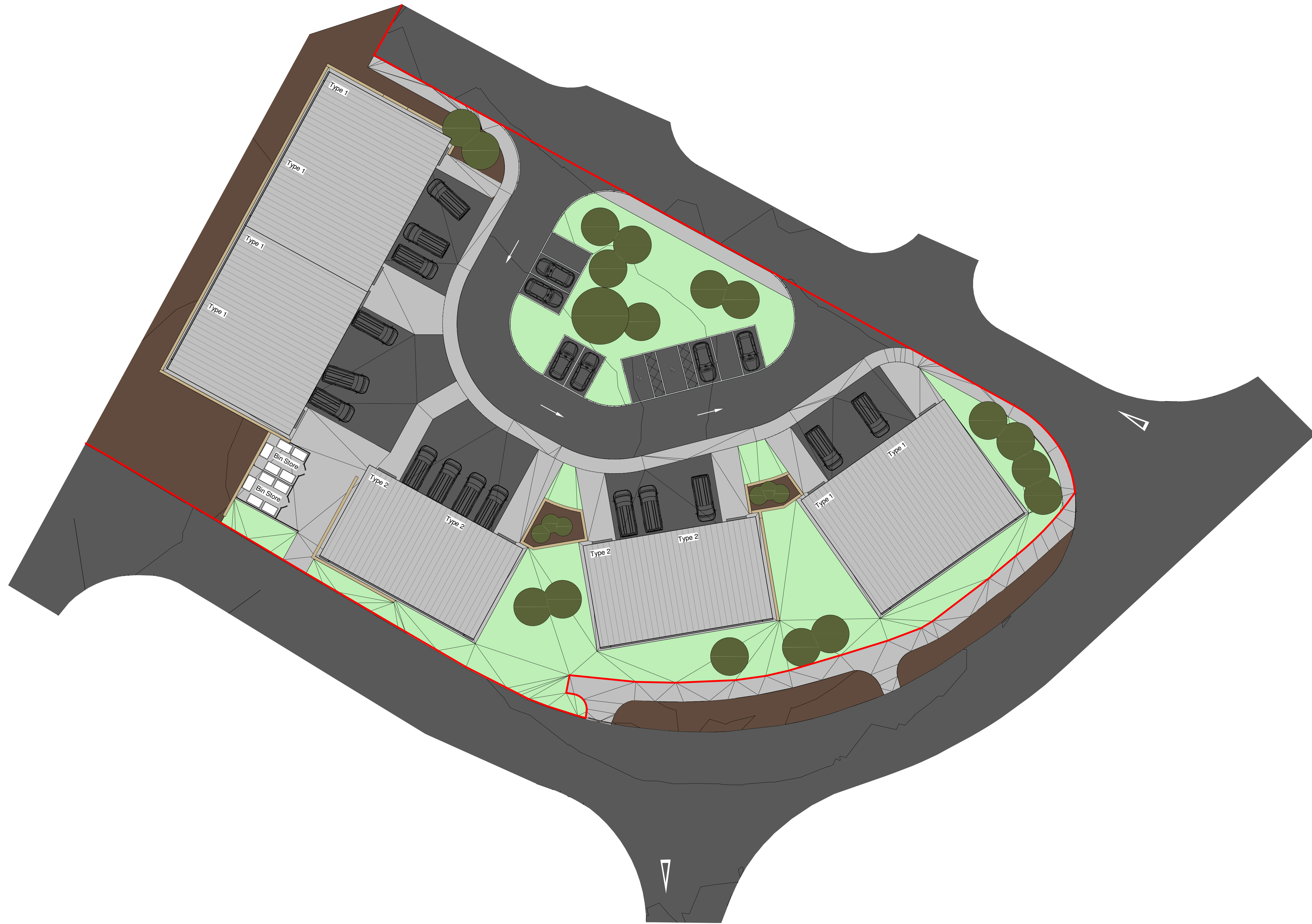
Proposed Site Plan 1 : 200